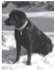
Good dog, Belle!

He also enjoys fishing. His most adventurous outing was a fishing trip to Alaska, where he caught salmon on the rivers, and halibut on the ocean.