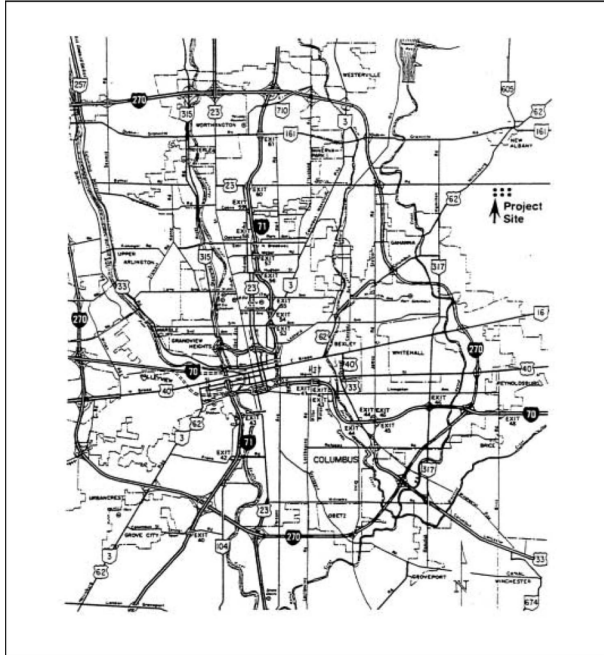
Example: Vicinity Map