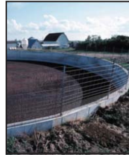
Manure storage structure