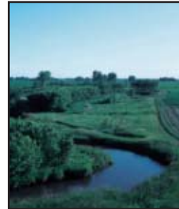
Vegetated buffer strip