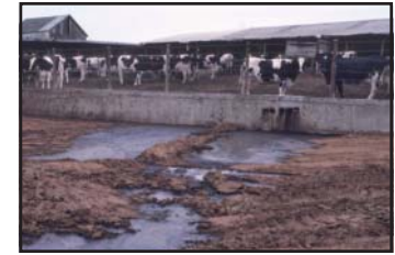
Manure and feedlot runoff

Other potential sources of pollution from livestock operations, such as milk house waste and silage leachate, are also addressed in these rules and standards.