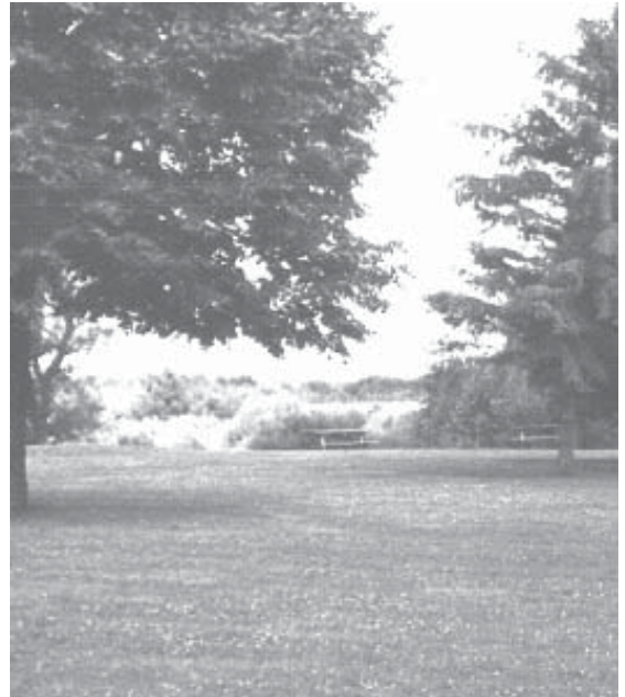
Open grassy lawns, picnic and play areas are still appealing to some participants. Some others prefer a more "wild," less "manicured" landscape treatment. Still others hold that 88 acres is big enough to allow multiple landscape styles and accompanying uses.

Parkland — bird sanctuary and wildlife preserve if hiking and picnicking can occur.