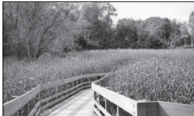
Boardwalks such as those used at the Nature Center at Shaker Lakes are cited as an appropriate way to guide, direct and limit public access.

Public access, hike/bike paths with separate fly-way areas for birds and wildlife (these areas would have no public access), i.e. Chicago model.