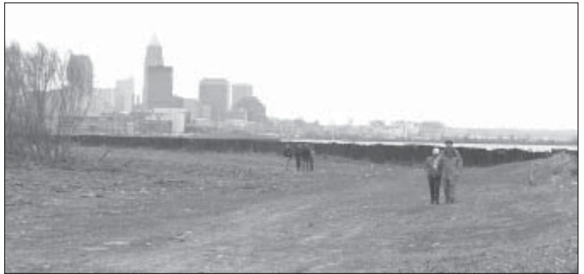
New views of Downtown Cleveland and the Lake are seen from the Dike's perimeter.

A number of participants have suggested that site design treat the interior acreage differently than the Lake-edge perimeter, or that different sectors of the 88 acres could be reserved for different purposes.