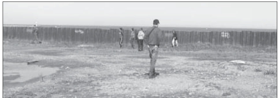
Participants express strong desires for connections to Lake Erie, but the Lake is barely visible from sections of the Dike where steel bulkheading looms several feet above grade. Birders point out, however, that this same high bulkheading affords protection to migratory birds.

Dike 14 would be a good place to watch the air show [GLV]