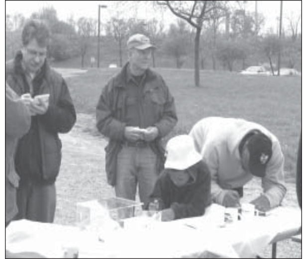
Participants of all ages offered their opinions at the Dike 14 “Open Gate” event.

* One participant proposed a limited amount of condominium development on the site. The ideas was offered as a suggestion to help finance public open space (see “New Ideas,” page 3).