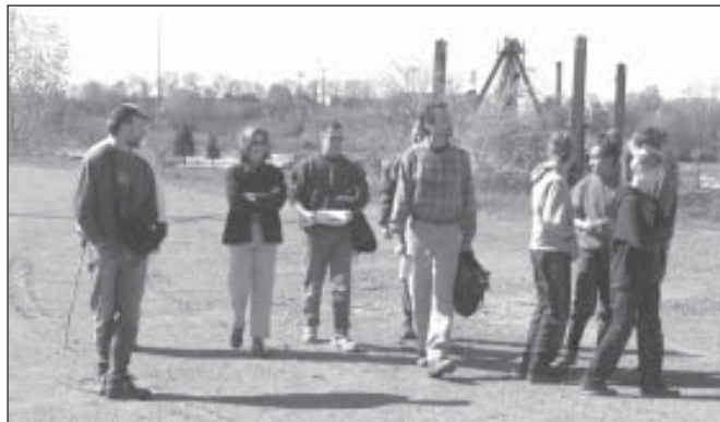
Education for children and adults was listed as a goal by many.

At the south edge of the site, an environmental center or something like the Horticultural Center at Washington Park — working with schools. [NEC]