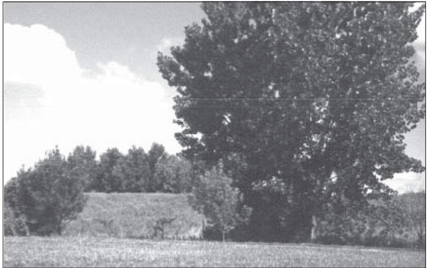
Wild or managed, green wins.

I like the idea of development [to] keep it natural — no commercialism. Dog Park. Trails. Connect to Edgewater.