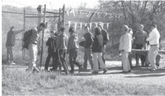
4 May 2002 First Tour Visitors through the Gate

This should be a Bird Sanctuary, Nature Preserve, and/or sculpture park.