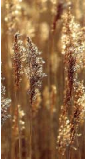
The invasive reed phragmites is prevalent on Dike 14.

Controlling invasive, non-native plants and improving habitat and landscape were addressed as a need. Consistent with other comments, a more “natural” or “rustic” landscape approach appears to be favored by most.