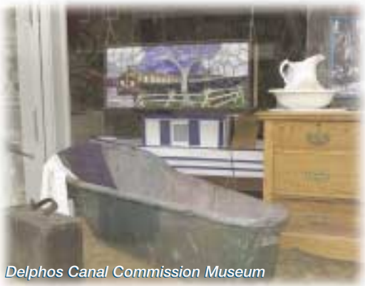
Delphos Canal Commission Museum