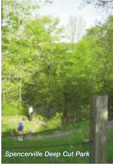
Spencerville Deep Cut Park