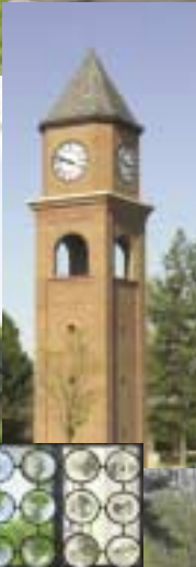
St. Marys Memorial Park