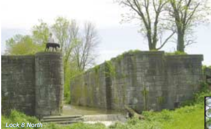
Lock 8 North