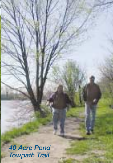
40 Acre Pond Towpath Trail