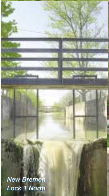
New Bremen Lock 1 North