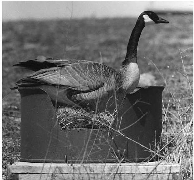
Canada goose nesting tub

five feet from the water's surface. Fill the tub with 5–10 inches of straw or hay.